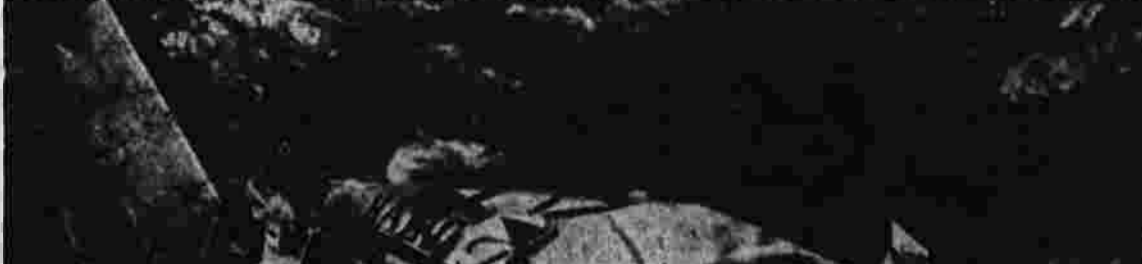
A state trooper peers into the wreckage of the private plane which crashed near Klamath Falls, Ore., killing the governor of the state, Earl Earl, two top state officials and the pilot.